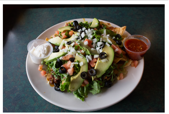
Eddie's Loaded Nachos