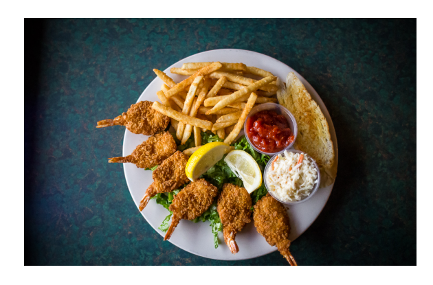
Eddies Shrimp Dinner Follow Eddie's of Arlington on Facebook for any Announcements!